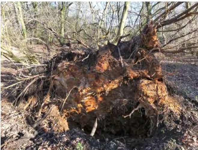
Fallen tree giving exposure of sand and pockets of gravel