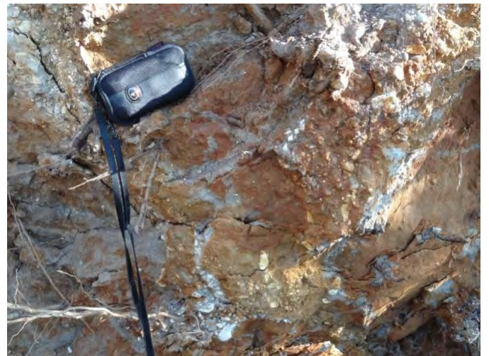
Part of photo on the left showing lenses/streaks of grey silt or sand (camera case 130mm long)