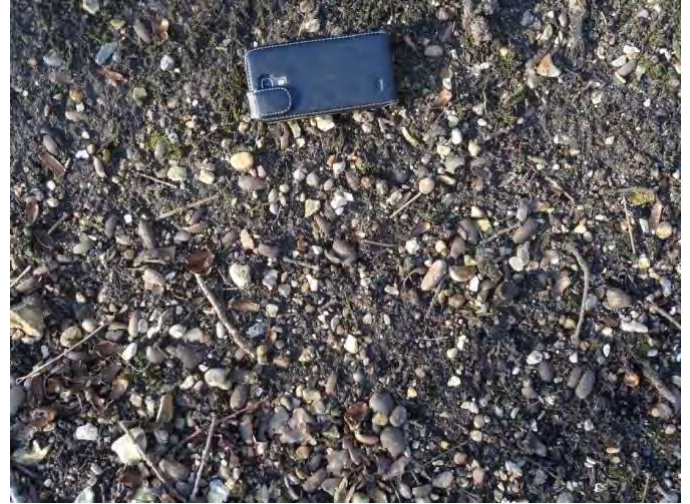
Gravel on rim of one of the pits (phone case 130mm long)